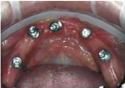
Fig. 4b Occlusal view of impression copings