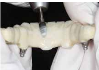
Fig. 4d Laboratory made provisionals