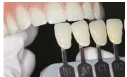
Fig. 3d Shade selection with existing denture