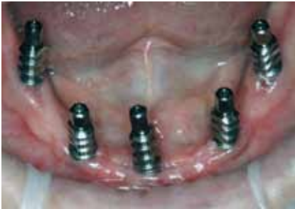
Fig. 4a Pick-up impression coping in place

Fixed provisionalisation was deemed necessary to ascertain functional, aesthetic and phonetic performance.