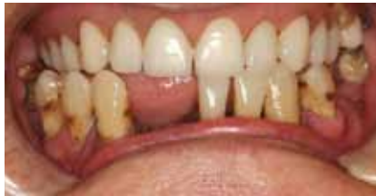
Fig. 1a Frontal view

The soft tissues and lymph nodes were examined and checked and found to be unremarkable, indicative of a clear oral cancer screening check.