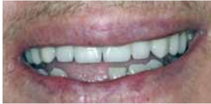
Fig. 1b Frontal view-smile