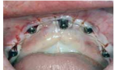
Fig. 3b Occlusal view of edentulous mandible with healing abutments in place.