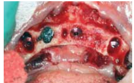
Fig. 3a Implant placement