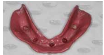
Fig. 3c The existing mandibular denture was relieved, relined and repolished.