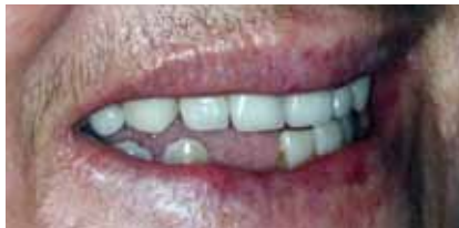
Fig. 1c Right lateral