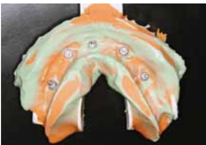
Fig. 4c Open-tray impression technique for the fabrication of the restorations.