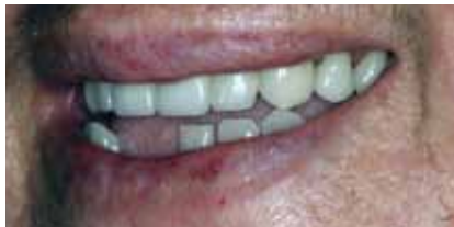
Fig. 1d Left lateral